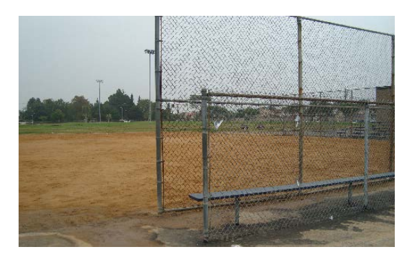
Softball infield and backstop are in poor condition.