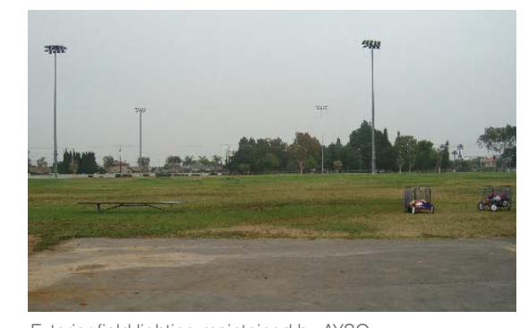
Exterior field lighting maintained by AYSO.