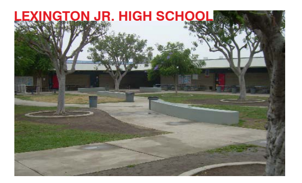
Improve campus quad.