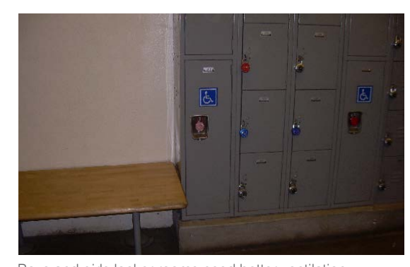
Boys and girls locker rooms need better ventilation.