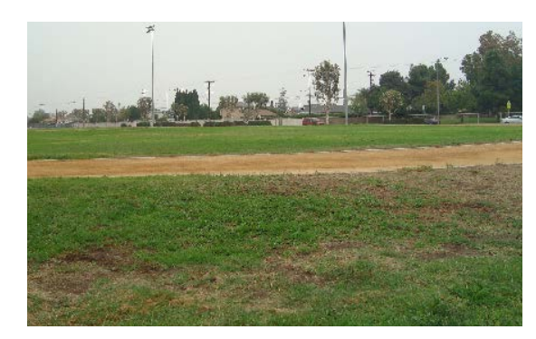
Playing fields are in poor condition.