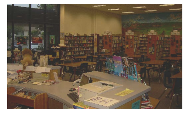
Library/Media Center is in need of an upgrade.