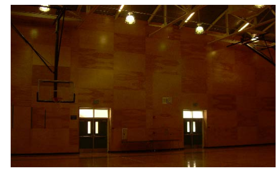
Gymnasium floor needs to be refinished.